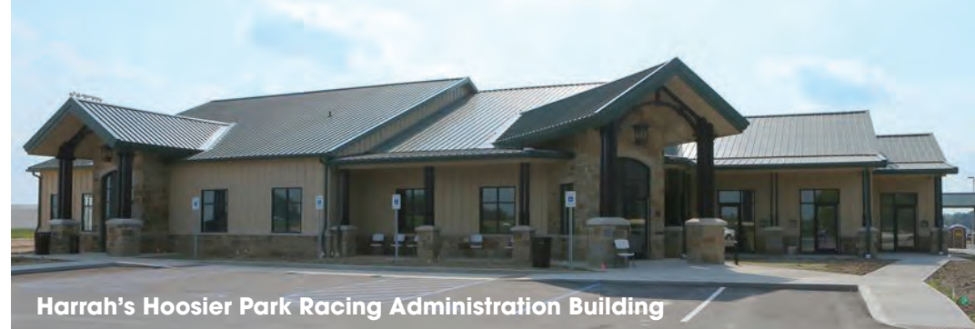
Harrah's Hoosier Park Racing Administration Building