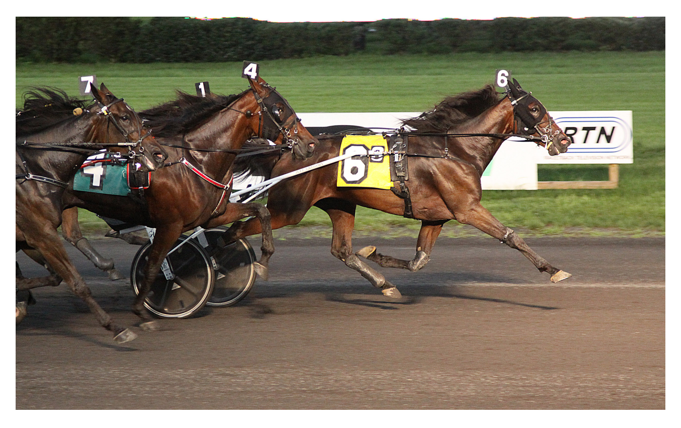
Hambletonian & Hambletonian Oaks No. 96 February 15, 2021 Payment